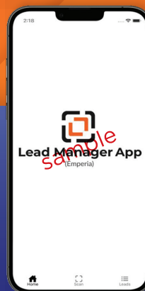
Lead Manager App