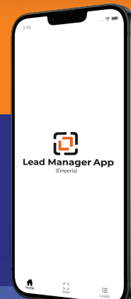
Lead Manager App